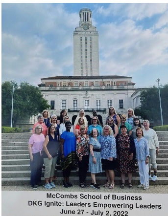
McCombs School of Business DKG Ignite: Leaders Empowering Leaders June 27 - July 2, 2022

It's hard to believe that summer is almost over. I trust you had a great time, filled with exciting trips, visits with friends and family, gardening, camping, and quiet, peaceful days in your backyard. The highlight of my summer was the trip to Austin where I participated in DKG Ignite leadership seminar (the former Golden Gift seminar). I was one of 21 members, all from different states and countries. We spent a whole week on the lovely (and very hot!) University of Texas campus, attending lectures and meetings from 8:30 AM to 9 PM. The impact of this experience is unimaginable. It gave me a new perspective on the things I do as a person, professional, and a DKG member. I also have 20 new friends on whose support and advice I may always count. Come to the fall conference to hear more!