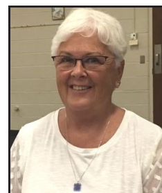
State Necrology Chair 2021-2023