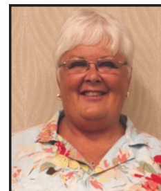
State Necrology Chair 2017-2019